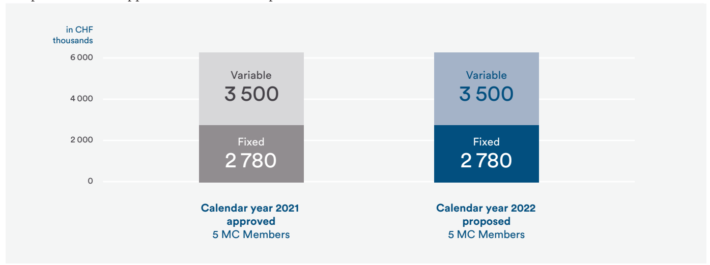
Figure 5: Proposed Management Committee compensation elements