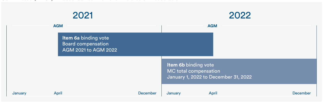
Figure 1: Compensation periods for the Board of Directors and the Management Committee ("MC") in accordance with the Articles of Association

The AGM separately votes on the maximum aggregate amount of compensation for the Board of Directors and for the Management Committee. The budget period for the Board of Directors is aligned with the term of office, which is the period from one AGM to the next. For the Management Committee, the budget period for the maximum aggregate amount of total compensation, comprising both fixed and variable compensation, is aligned with the following financial year.