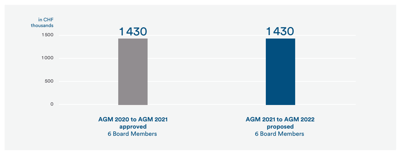
Figure 2: Proposed maximum board compensation compared with the previous period (aggregate amounts)

The proposed maximum aggregate amount of compensation for the Board of Directors for the period from the AGM 2021 to the AGM 2022 amounts to CHF 1,430,000.